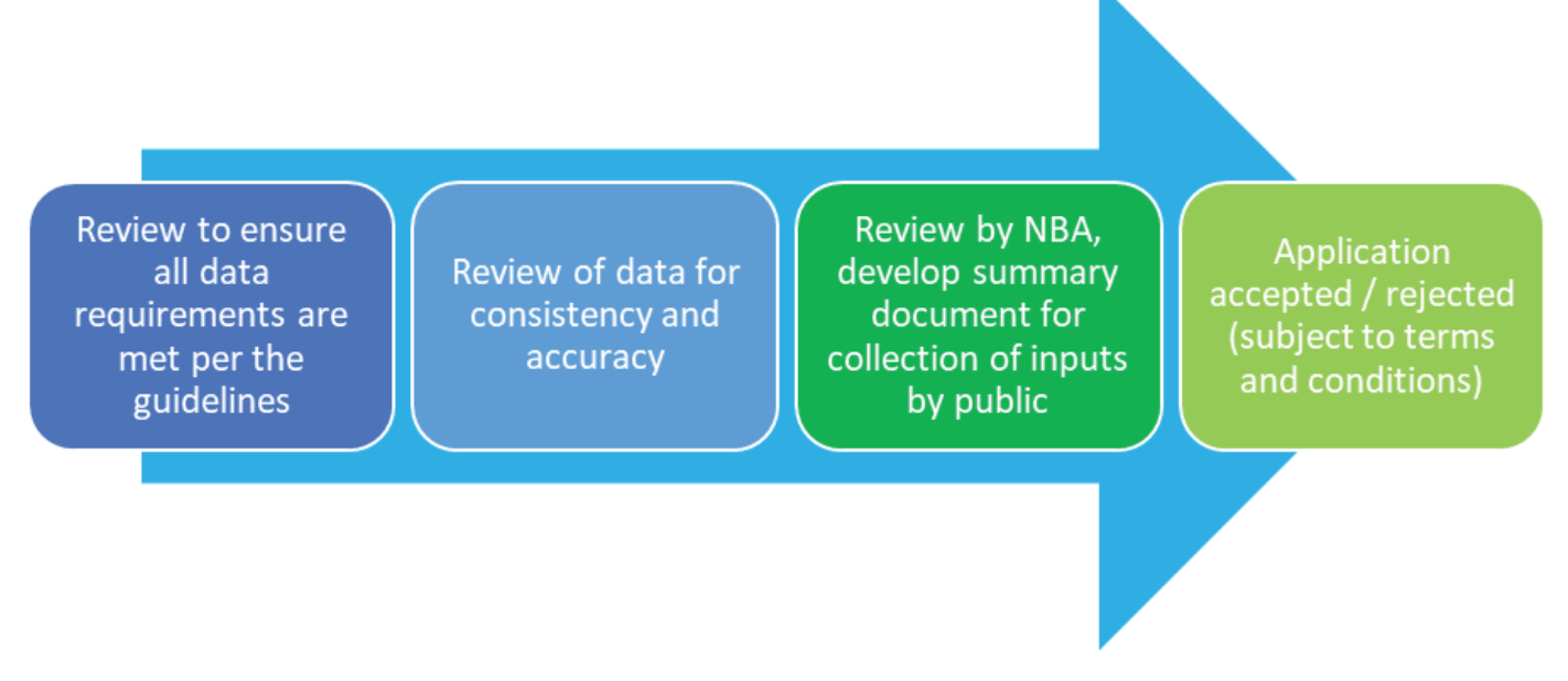
Figure-1: Regulatory approval process and evaluation of biosafety dossier.

The gathered information is then submitted to a diverse panel of experts to give opinions on different dossier sections. Next, the experts develop a decision document detailing the risks associated with approving the project by considering perceived effects on the environment, food and feed, socio-economic, ethical and legal issues. The NBA ensures that the experts do not have any conflict of interest with the application undergoing review. Finally, the document is submitted to the public to submit their views before the NBA makes public its decision on whether to approve, reject the application – with terms and conditions.