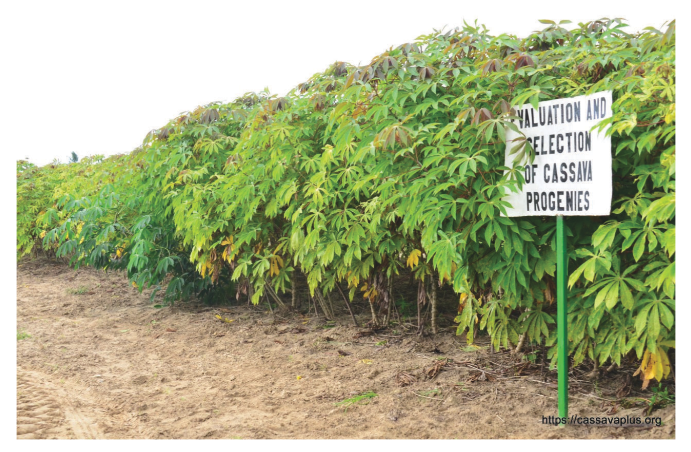
GM Cassava crops at the Confined Field Trials in Mtwapa