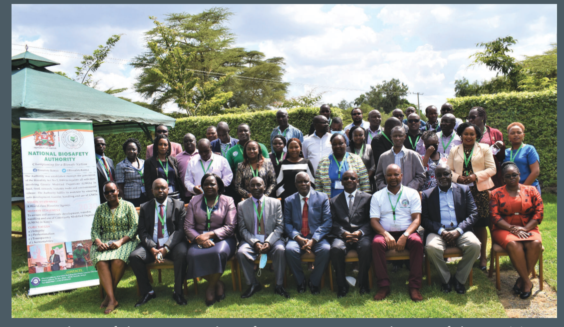
A group photo of the NBA Board, conference sponsors and some of the participants.

We thank all the participants who created time to be with us at the Conference.