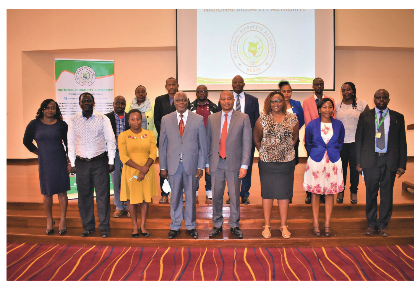
The NBA technical team and the Institutional Biosafety Committee (IBC) members in a group photo during the capacity-building event at the Movenpick Hotel, Westlands- Nairobi.

Currently, the institutions with active GMO projects are; Kenya Agricultural & Livestock Research Organization (KALRO), International Livestock Research Institute (ILRI), International Centre of Insect Physiology and Ecology (ICIPE), Kenyatta University (K.U.), and Masinde Muliro University of Science and Technology (MMUST).