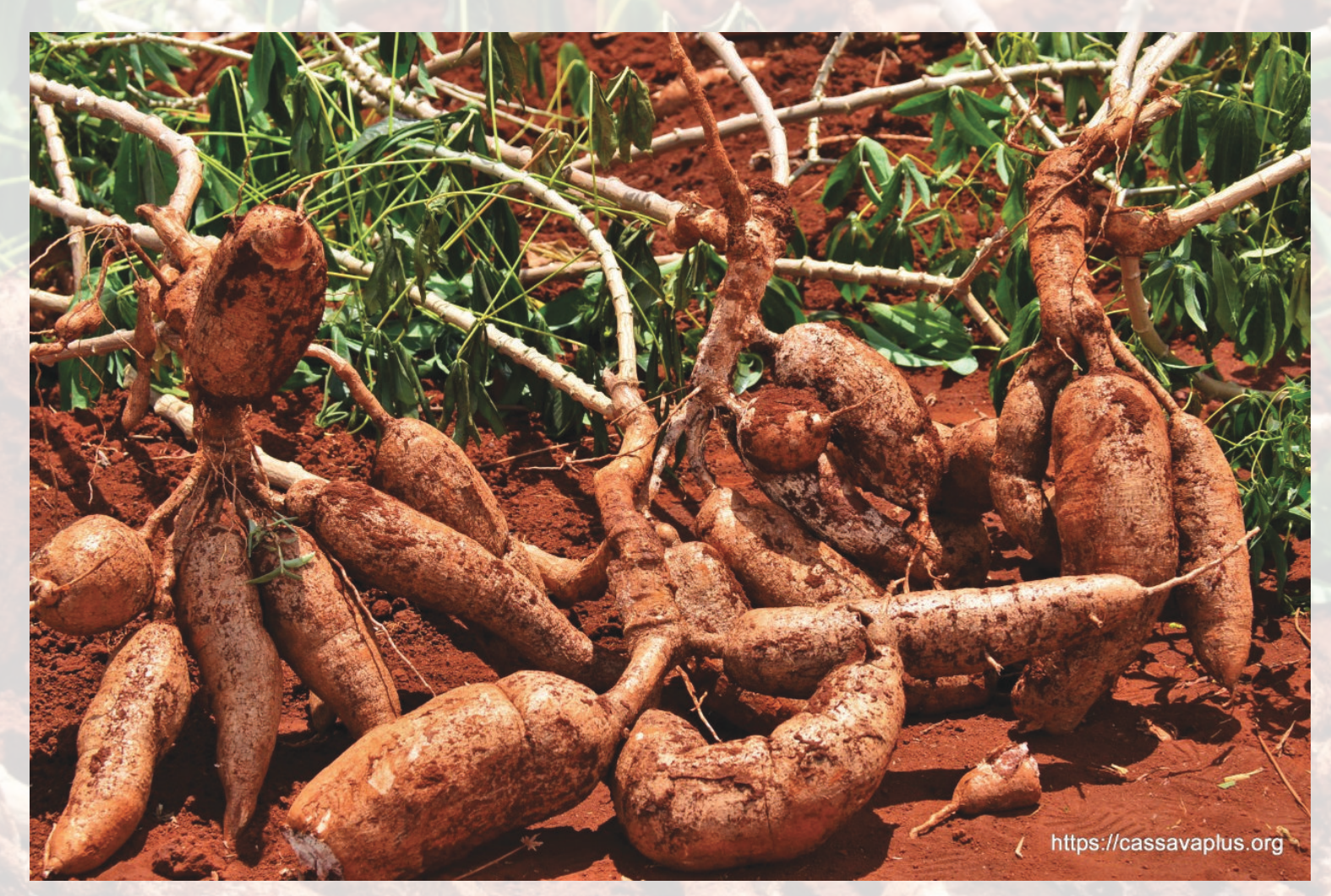
GM Cassava harvest at the Confined Field Trials in Kandara, Murangá