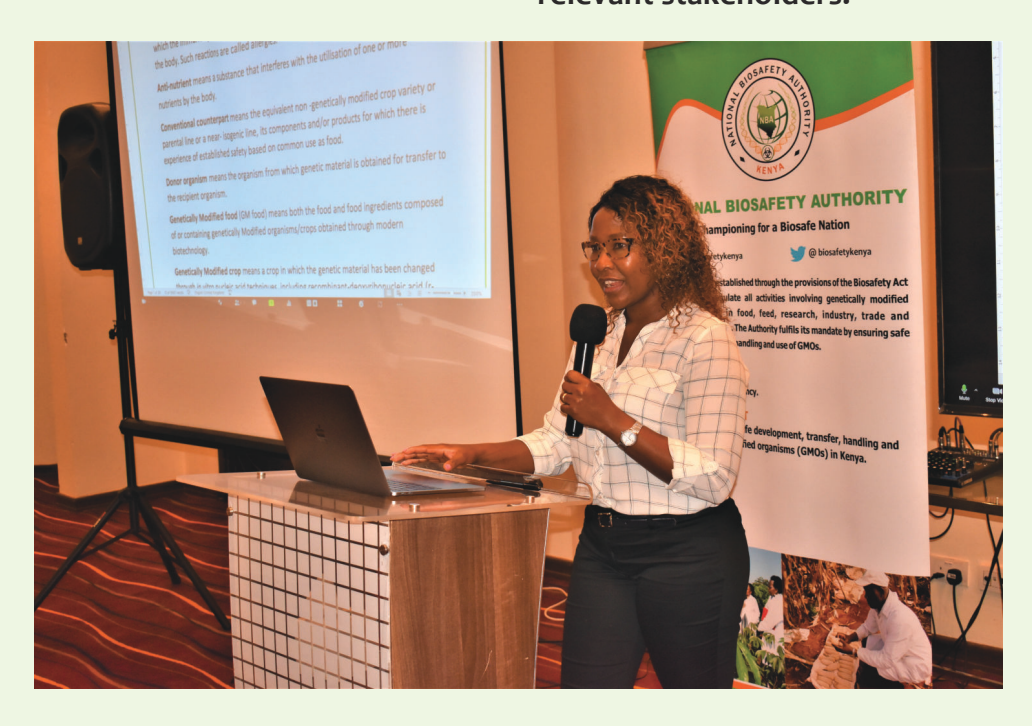
Presentation by an NBA Biosafety Officer during the Consultative Meeting on Guidelines for Food Safety Assessment, Environmental Risk Assessment, and Stacked G.M. Events.

The stakeholders present in the meeting were from regulatory agencies in Kenya, research organizations, universities, the Agriculture Sector Network, the private sector, and other relevant stakeholders.